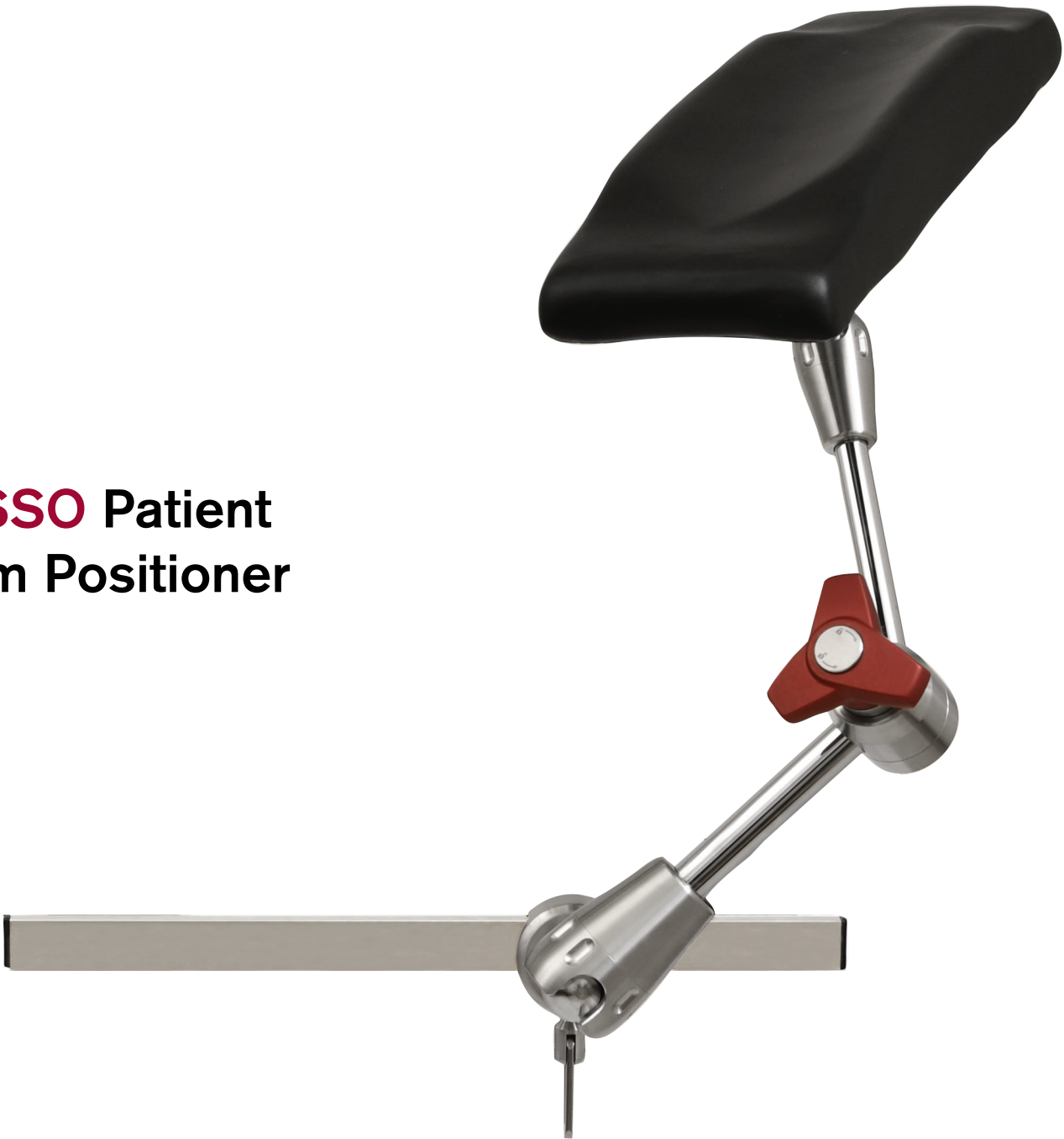
FISSO Patient Arm Positioner

NOVID SURGICAL 27 Siemon Company Drive Suite 104W Watertown, CT 06795 Telephone 860.274.5900 www.novidsurgical.com info@novidsurgical.com