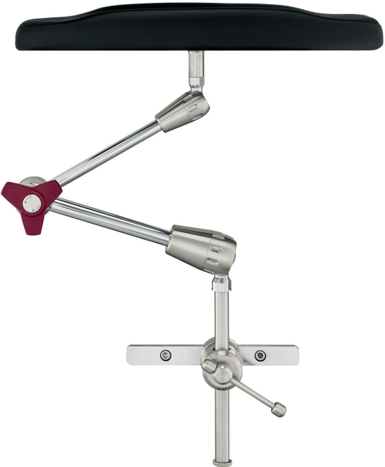
6656.02 Vertical Arm Support