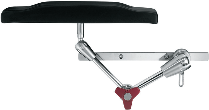
6646.01 Lateral Arm Support