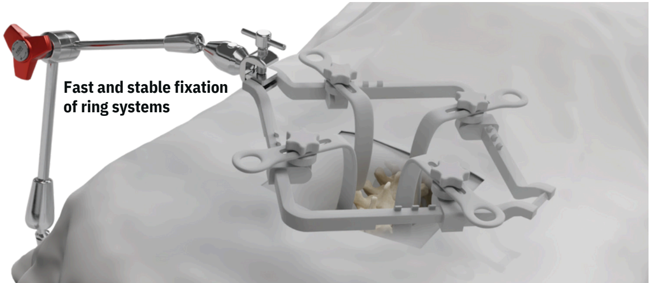
Fast and stable fixation of ring systems

Our customers confirm that we are the leading company for superior quality articulated arms with central locking mechanism: