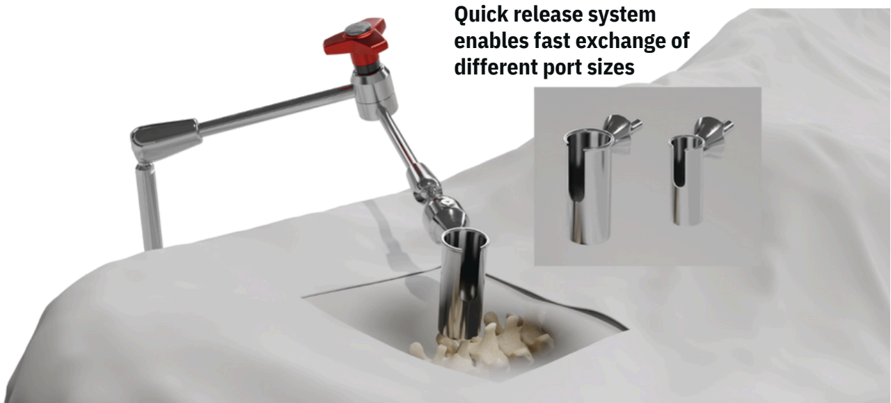
Quick release system enables fast exchange of different port sizes